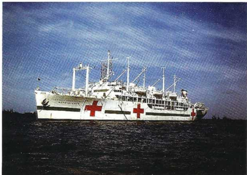
The USS Benevolence hospital ship is seen in this file photo. The Benevolence collided on Aug. 15, 1950, with the freighter Mary Luckenbach and sank in a blinding fog a few miles outside the Golden Gate Bridge. Of the 500 crew members on board, 23 lost their lives that day. (Staff Archives)

Holly did. Then he tried to release lifeboats, to no avail. The 577-foot-long ship continued to roll. "The spirit in me said, 'Jump into the ocean off the starboard side as she's going down,'" he said, "'and swim, swim as fast as you can.'"