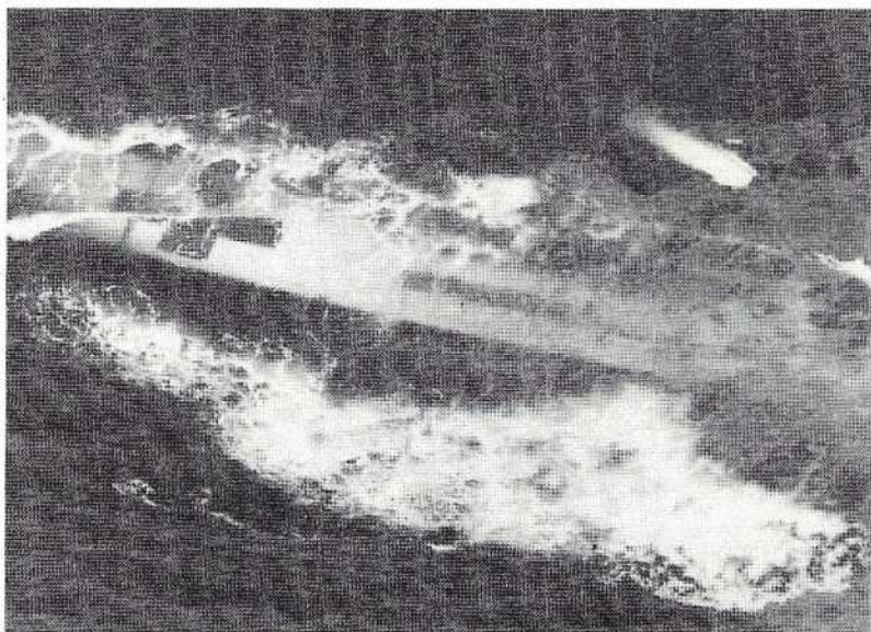
The USS Benevolence is shown lying on its side in 75 feet of water in this archives photo, the red cross on its hull visible through the waves. The Benevolence collided on Aug. 25, 1950, with the freighter Mary Luckenbach in a blinding fog and sank a few miles outside the Golden Gate Bridge. Of the 528 crew members on board, 23 lost their lives that day.

plasma. The spirit said, "Wrap your body around that box and just hold on."